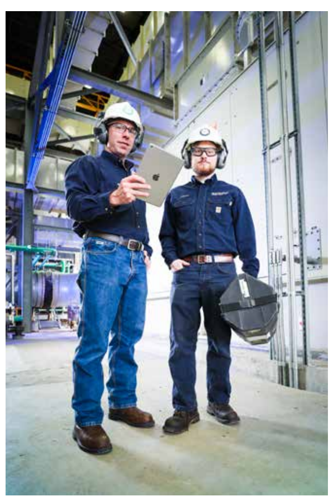
Customer Support - USA

Solar manufactures mechanical-drive packages that are completely factory packaged and tested to drive a variety of centrifugal and reciprocating compressors for air, process and refrigeration applications. They also drive pumps for waterflooding and transportation of crude oil and other liquid products. To facilitate the driver/driven equipment interface, Solar offers single-source responsibility for a complete package when Solar supplies the driven equipment. Solar can provide the packaging expertise required when the driven equipment is supplied by other manufacturers.