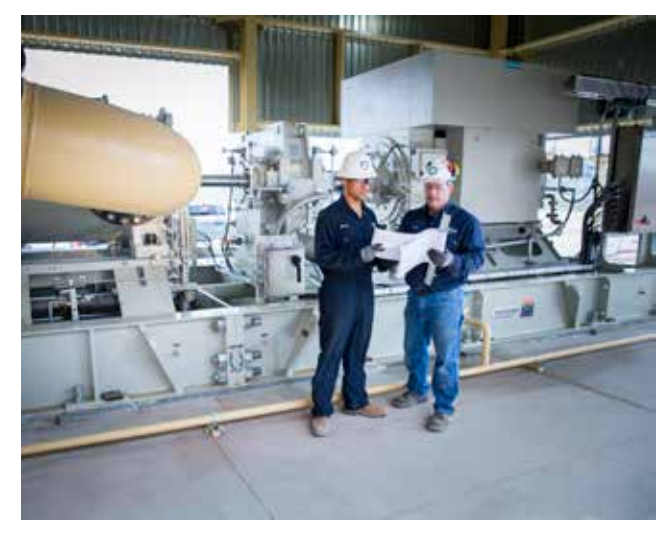
Electric Motor Drive, C33 Compressor - USA